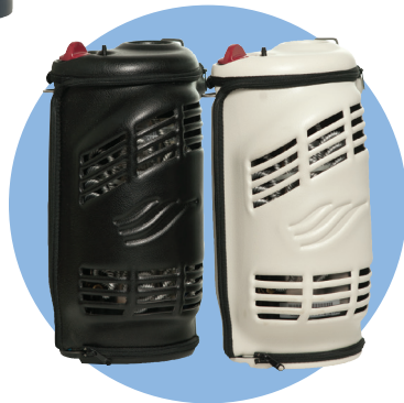
Soft Case Stroller